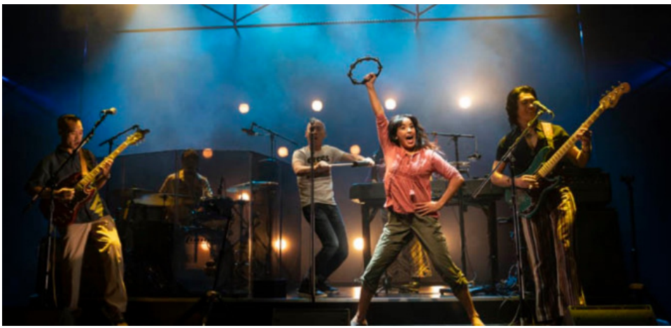
'Cambodian Rock Band'